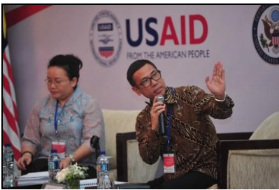
Delegates discuss the contents of the Regional Review on TIP during the launch event in Jakarta on September 28 th , 2016.

agreements. This new system will be adopted and managed by the ASEAN Secretariat and will be the basis from which the Secretary General reports to the ASEAN Leaders on Member States' implementation of ASEAN agreements. PROGRESS will also support the drafting of legal overviews for key ASEAN agreements to generate greater public awareness and to facilitate better overall implementation.